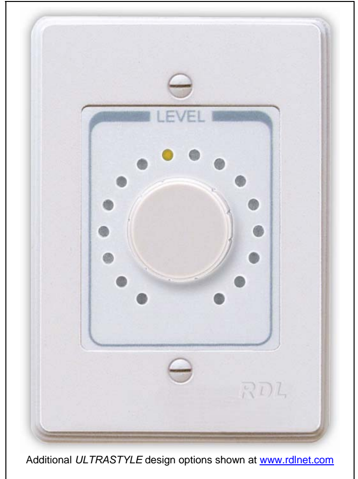
Additional ULTRASTYLE design options shown at www.rdlnet.com

Wherever the highest quality, durability, performance and appearance are required in remote level control, the RLC-10R is the ideal choice. Use the RLC-10R individually, or combine it with other RDL products as part of a complete audio/video system.