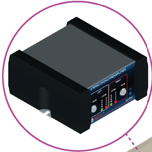
EZ-PH1 Phono Preampifier

Interface a Turntable to Audio Equipment with Line Inputs