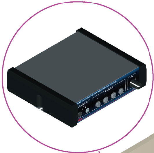
EZ-HSX4 Stereo Audio Input Switcher with Headphone Amp

Monitor Audio Outputs with Intergrated Headphone Amplifier