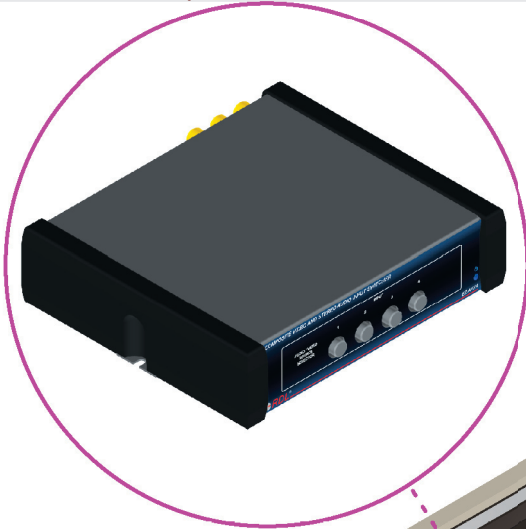
EZ-AVX4 Composite Video and Stereo Audio Input Switcher

Select Between 4 Composite Video and Stereo Audio Sources