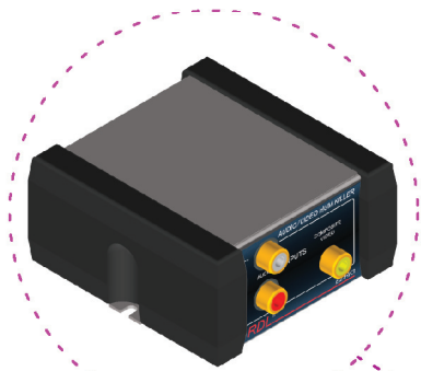
EZ-HK3 Audio/Video Hum Killer Use on the equipment cart or mount permanently to rear of monitor.

Galvanic Isolation for Audio and Composite Video "Ground Loops"