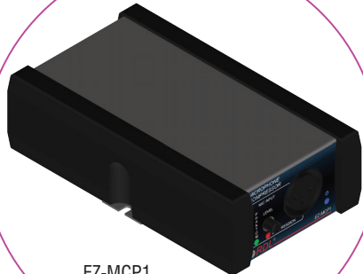
EZ-MCP1 Microphone Compressor

Microphone Compressor and Power Amplifier