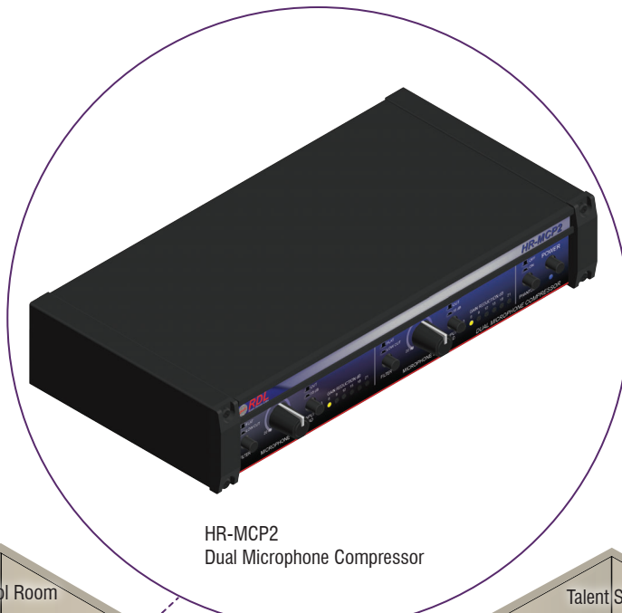
HR-MCP2 Dual Microphone Compressor

Automatic Microphone Level Control in Broadcast and Voice-Over Studios