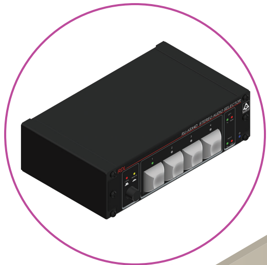
RU-ASX4D Stereo Audio Input Selector

Local Momentary Pushbuttons Provide Silent Soft-Switching of Four Consumer Audio Sources