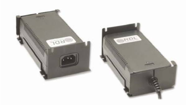
FP-PSB1 Power Supply Bracket with PS-24U2 mounted

The FP-PSB1 mounts to any flat surface or in an RDL Flat-Pak™ series rack mount panel (FP-RRR or FP-RRAH). The design of the FP-PSB1 allows it to slide into the Flat-Pak rack mount track. Mounting the FP-PA20 power amplifier (or other RDL modules using available adapter) together with the power supply conserves rack space and produces a convenient and professional installation.