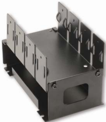
FP-PSB1 Power Supply Bracket with PS-24U2 mounted