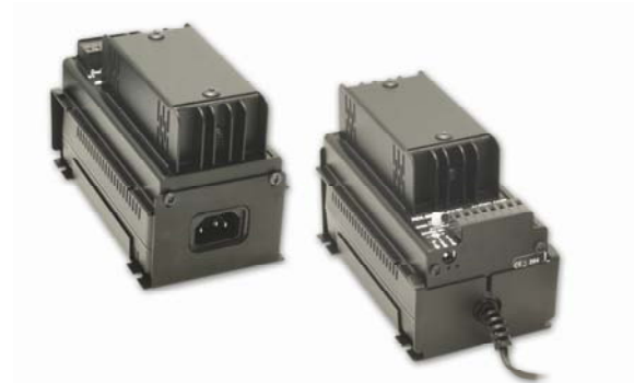
FP-PSB1 with PS-24U2 power supply and FP-PA20 audio amplifier mounted