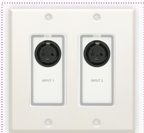
DD-BN2M Wall-Mounted Bi-Directional Mic/Line Dante Interface 2 x 2